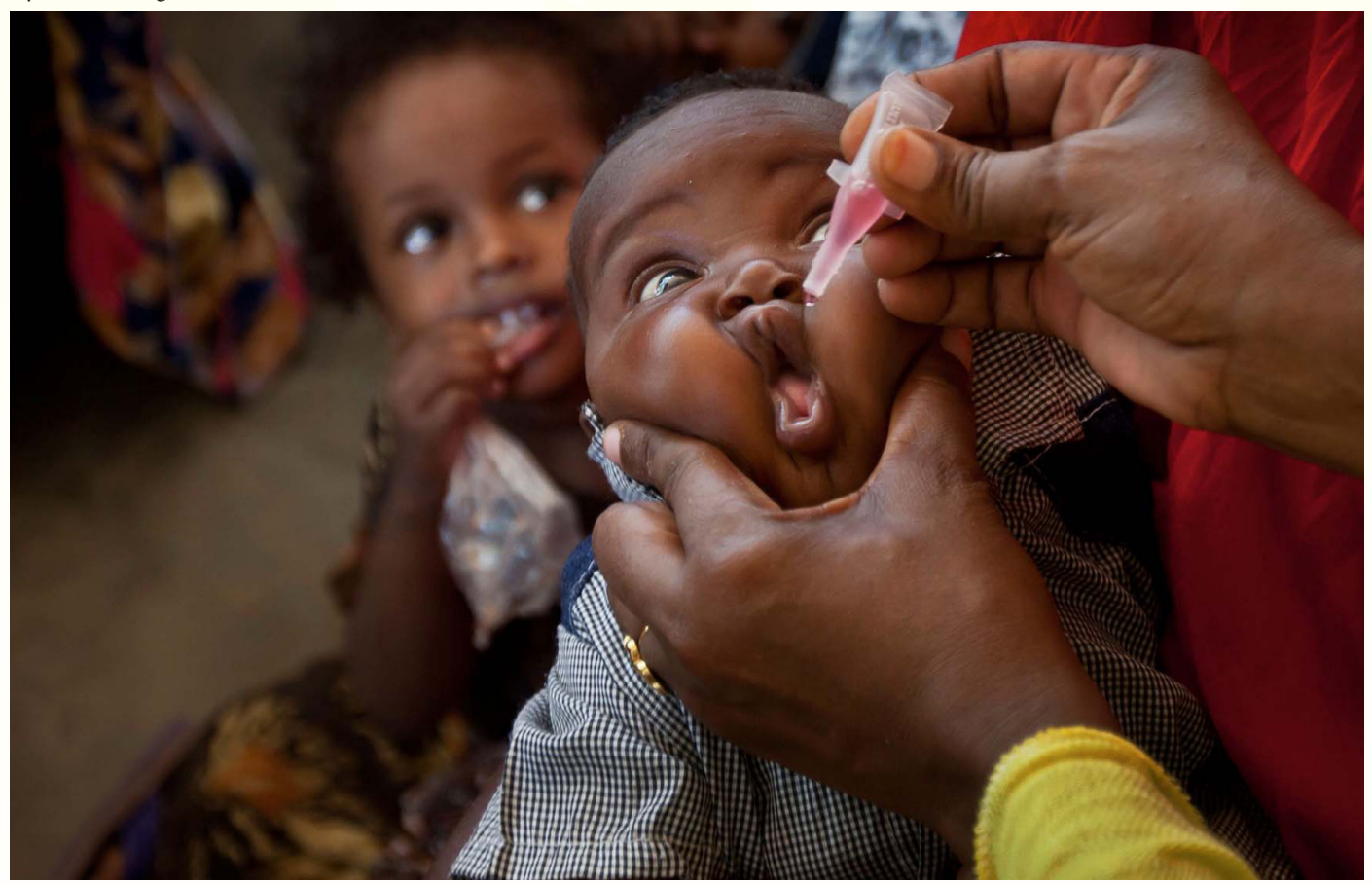
A child receives vitamins during a vaccination campaign against polio.

By Rose Achiego, Waumini Communications, KCCB