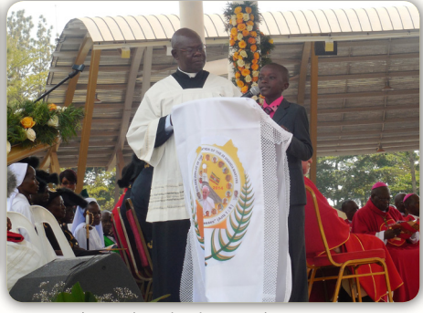
A young boy takes the first reading.