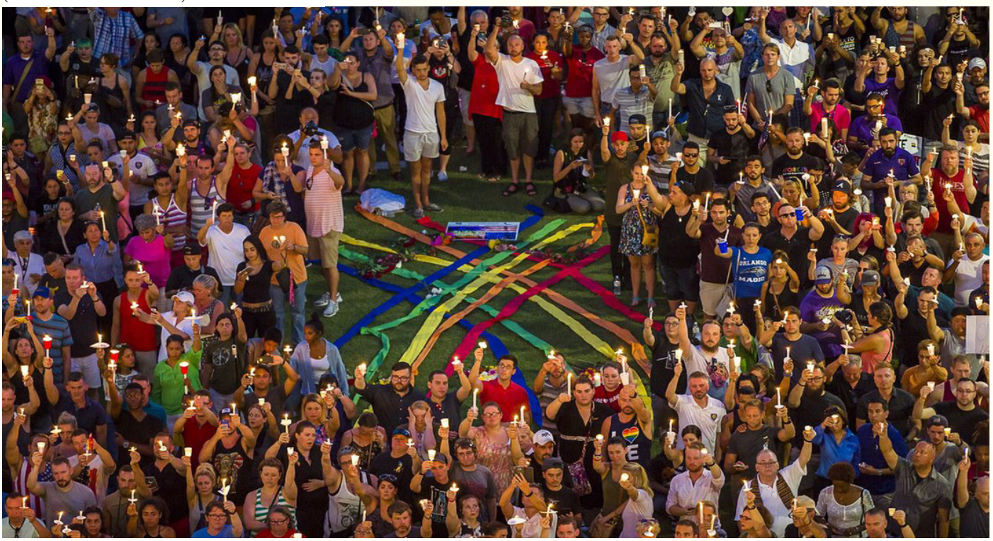
Thousands gather for a memorial rally at the Plaza at the Dr. Phillips Performing Arts Center in downtown Orlando on Monday, June 13, 2016 to honor those killed and wounded in the Pulse nightclub attack.