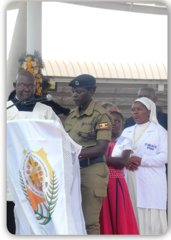
A police officer presents a petition.