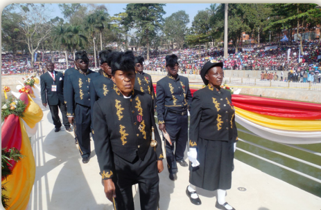
The smartly dressed Papal knights take part in the procession