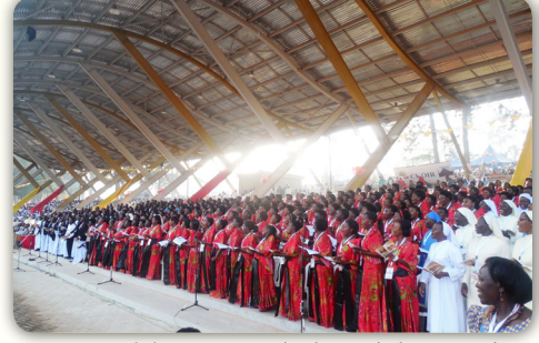
A section of the 450 smartly dressed choir members. a peaceful celebration