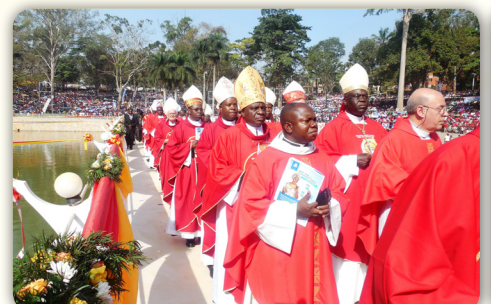
The bishops during the procession.