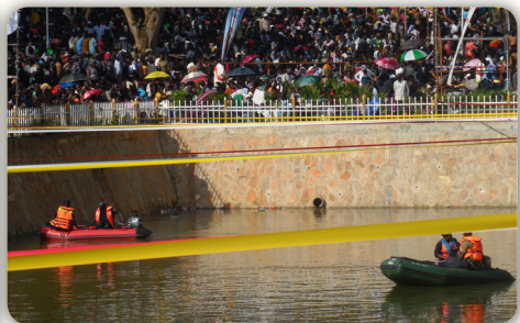
Security officers patrol the man-made lake to ensure A section of the international pilgrims.