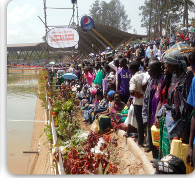
Pilgrims eagerly wait to draw water from the man-made lake after the celebration.