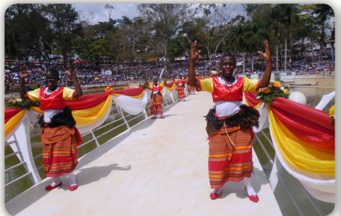
Some of the liturgical dancers dance at the celebration.