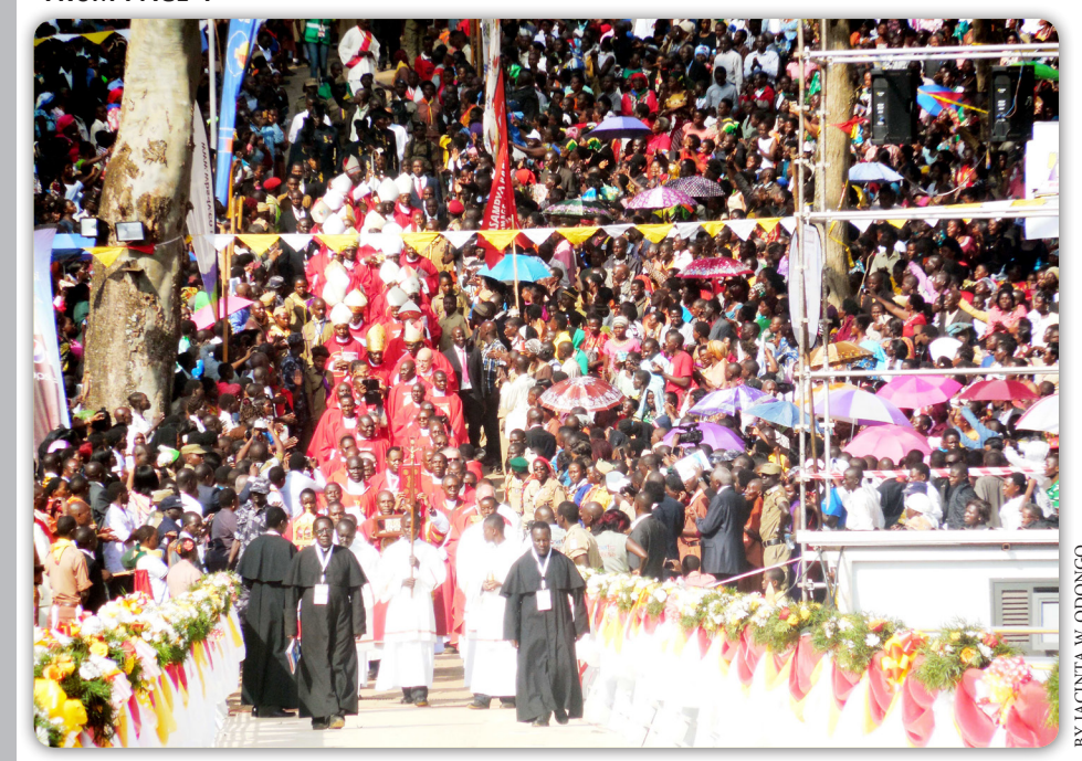
Pilgrims jubilate during the Bishop's procession.

DURING HIS VISIT TO UGANDA AT NAMUGONGO POPE FRANCIS TOLD US THAT FIDELITY TO GOD, HONESTY AND INTEGRITY OF LIFE AND GENUINE CONCERN FOR THE GOOD OF OTHERS BRING US THAT PEACE WHICH THE WORLD CANNOT GIVE. THAT IS DIVINE MERCY," HE SAID.